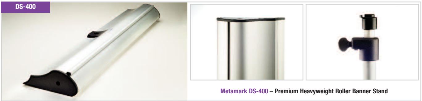
Metamark DS-400 – Premium Heavyweight Roller Banner Stand

For use with Metamark MD-RU160 or MD-RU170 media. The Graphic may be replaced with T-4970 Banner Tape.