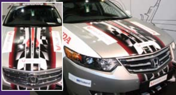
Honda ACCORD, wrapped with Metamark MD-7, using the skills of Walsall College students at the Roland DG Academy

The WorldSkills London 2011 Competition ran from October 5th for four days and was among the biggest events ever held at ExCeL London. Over 1,000 young people from all corners of the globe competed in 46 different skills, each hoping to be crowned the best in their chosen skill. Colleges and